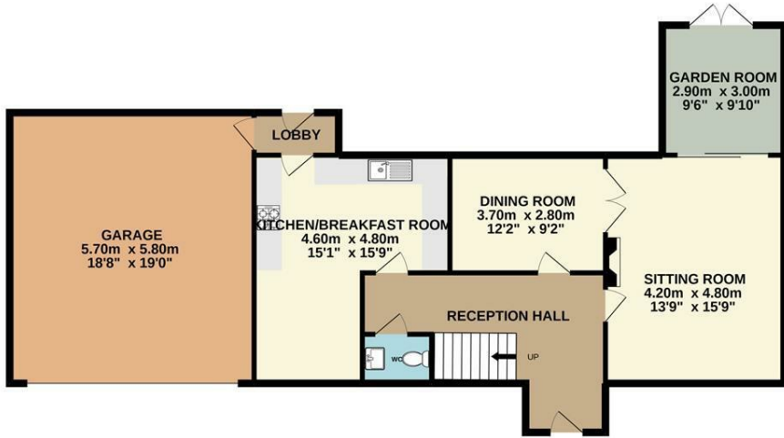
GROUND FLOOR 118.7 sq.m. (1277 sq.ft.) approx.